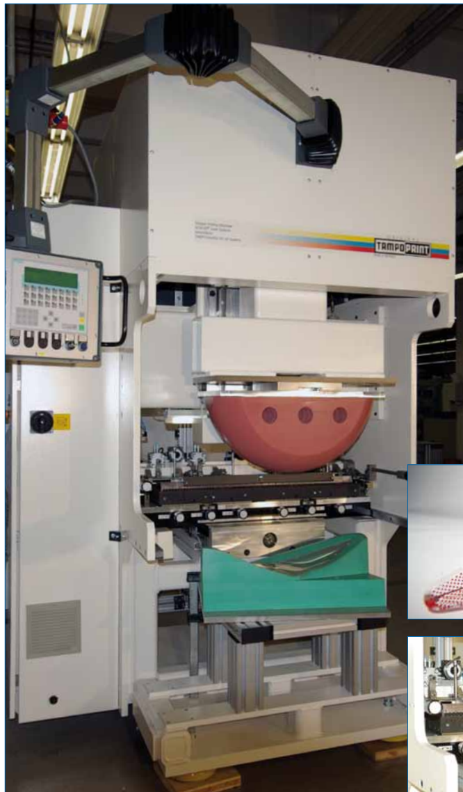
Fig.: Reference machine 1-colour printing on car rear light cover