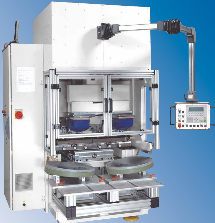
Fig.: TS 450/41 Reference machine 2-colour version Printing on satellite dishes